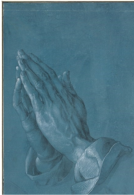
Praying Hands By Albrecht Dürer