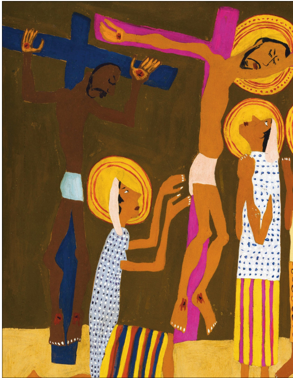
Mount Calvary, 1944 William H. Johnson

The scene is simple and graphic. The background, timeless and plain. The figures wear contemporary dress. In this crucifixion scene, there is no attempt at historical accuracy. We know about these people from the Gospel accounts of course, but here we feel for them.