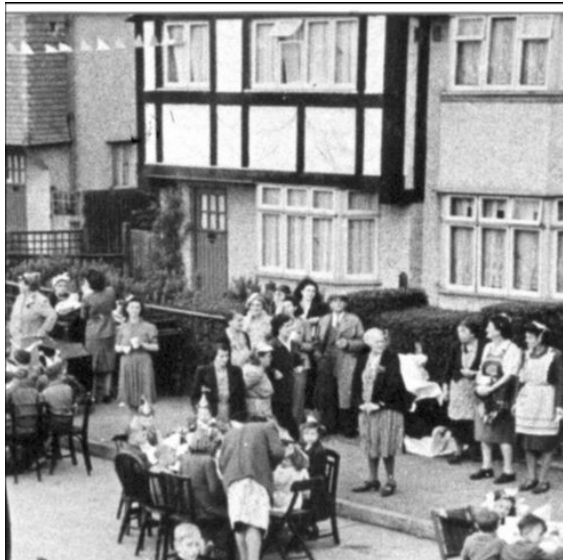
The image is of a VE Day party in Bramblewood Close, Carshalton in 1945!

On 8 May 2025, we mark the historic 80th anniversary of VE Day , with the peoples, families and communities of our great nation coming together to unite and celebrate 80 years of peace since the end of World War II in Europe that so many millions paid the ultimate sacrifice to achieve it.