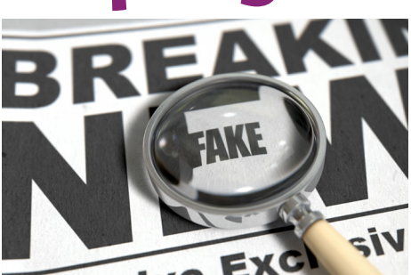
If someone asked, what is your 'evidence' for your faith?

As you share, eat some ring doughnuts – if you'd like to – to remind you of the holes in Jesus' hands and the truth of his resurrection.